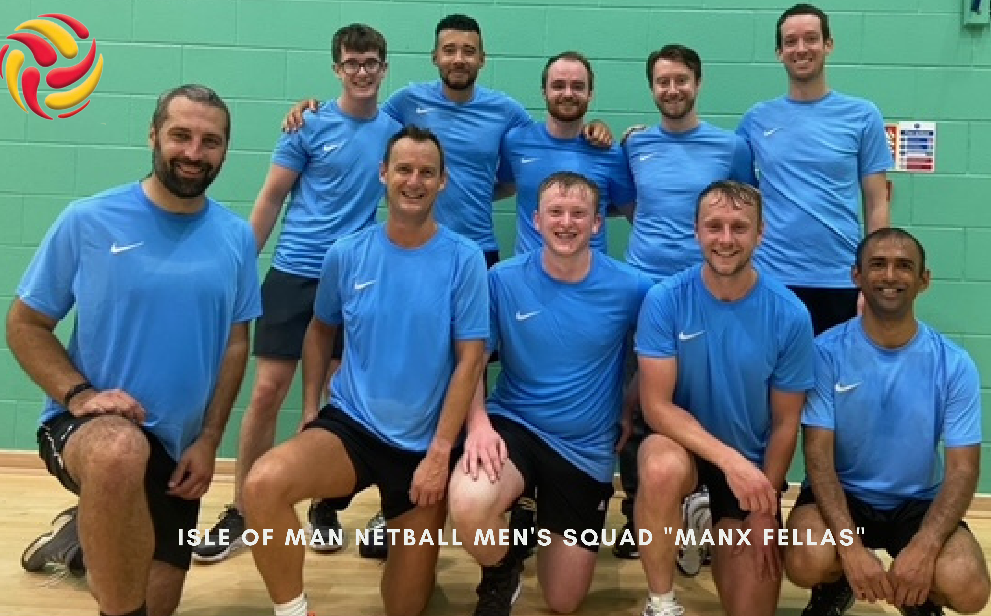
ISLE OF MAN NETBALL MEN'S SQUAD "MANX FELLAS"