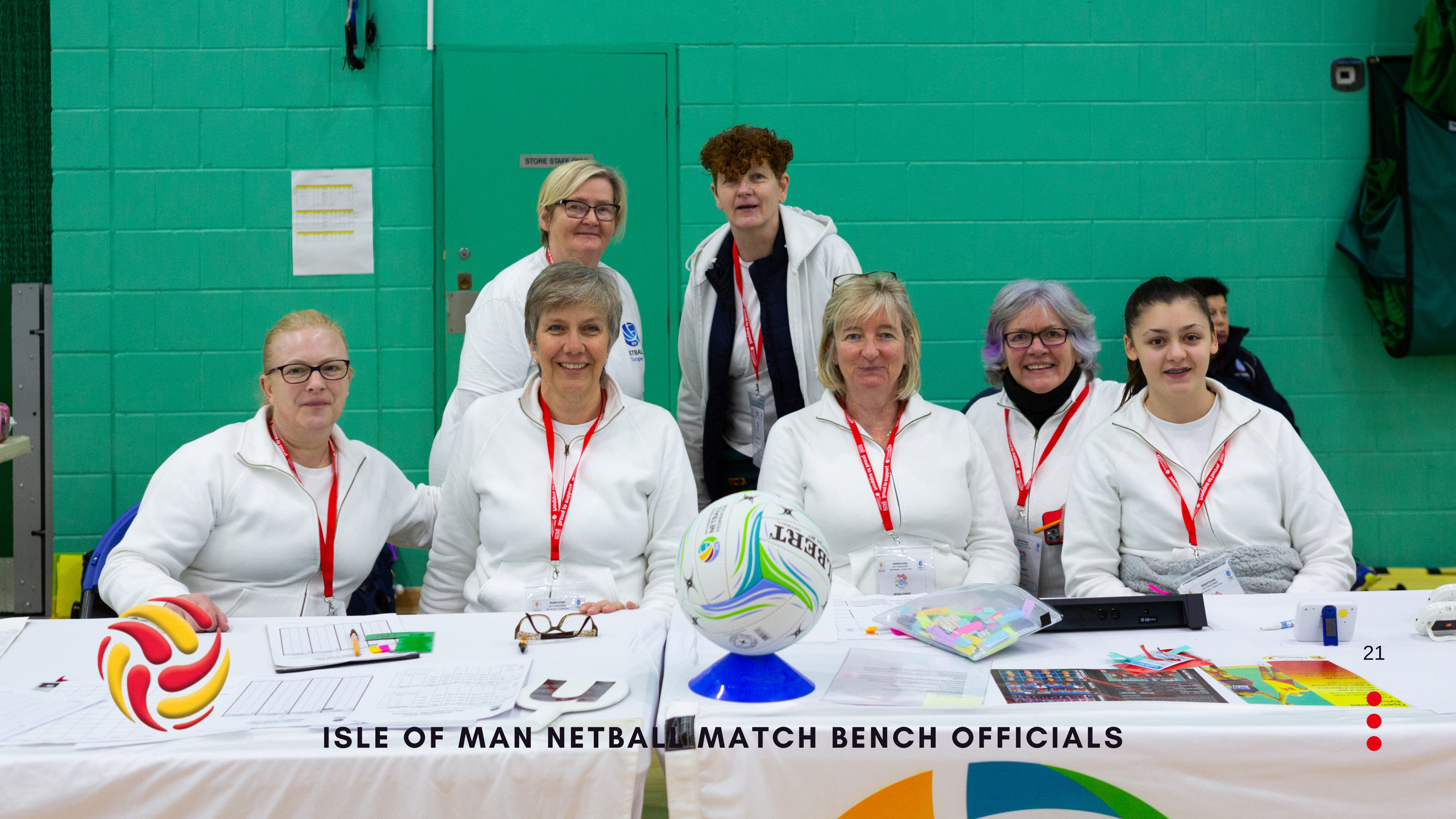
ISLE OF MAN NETBALL MATCH BENCH OFFICIALS